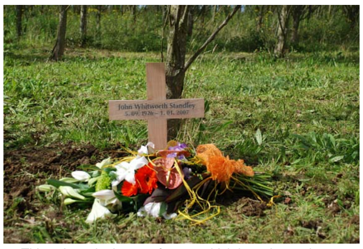
This ashes plot is one of many which have been chosen this year by families seeking a place for interment.

We have seen a considerable growth in interest in woodland burial across the media in the past year and we have noticed a corresponding increase in the number of people who have decided to be buried in the woodland. We have taken many reservations and quite a number of interments of ashes following cremation.